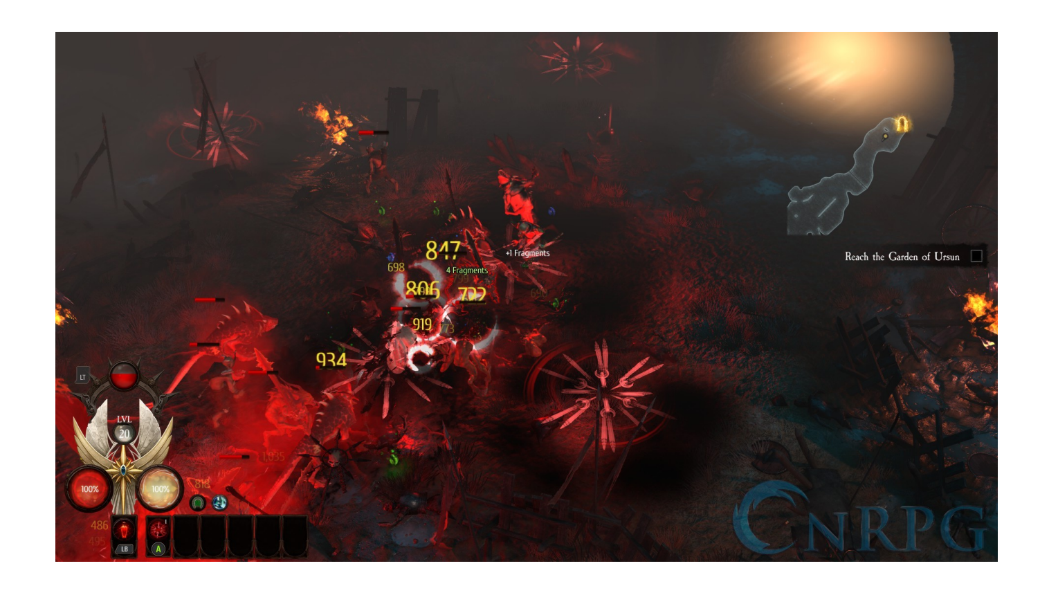
Akaneiro: Demon Hunters Cheat Code For Money